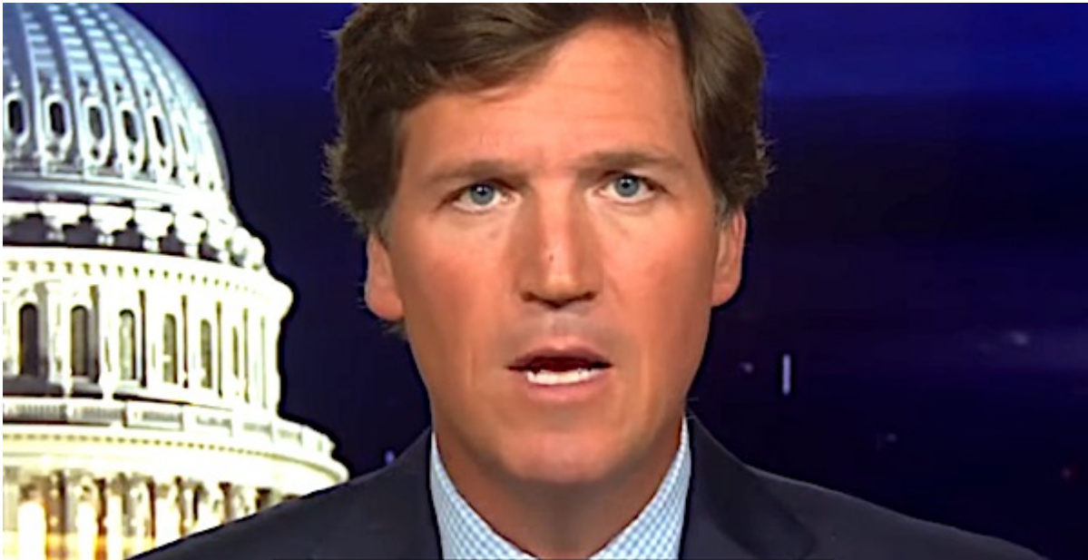
Tucker Carlson

Fox News host Tucker Carlson on Monday night called for allegations of vote fraud in the 2020 presidential election to be fully investigated before a winner is declared.